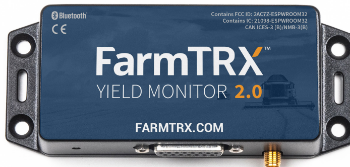
Yield Monitor 2.0 Power Unit

1) Consult your Yield Monitor Power Unit to determine if it is version 2.0. The power unit will feature the above label and an LED light on the front face. If it does not, refer to Directions for Yield Monitor 1.0 Operators .