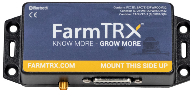
Yield Monitor 1.0 Power Unit

Directions for Yield Monitor 1.0 Operators: